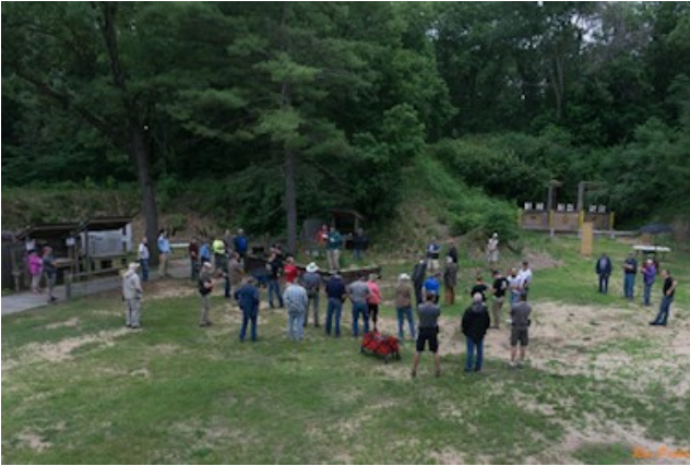
2018-06-23 DEFENSIVE PISTOL