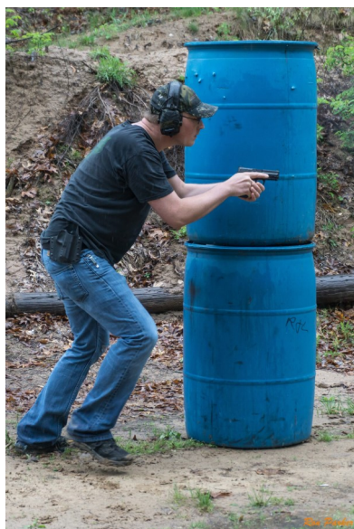
Defensive Pistol Shoot May 2018