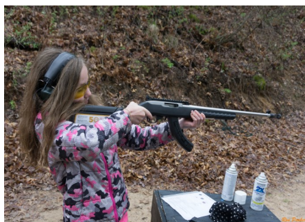
NSSF Rimfire Shoot May 2018